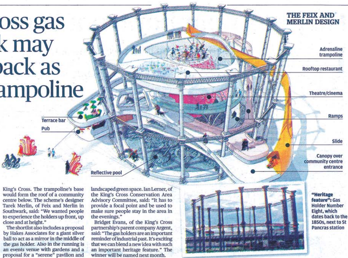
THE FEIX AND MERLIN DESIGN

One concept includes a giant slide to take visitors around the edges of the gas holder and a rooftop trampoline to allow people to bounce high above